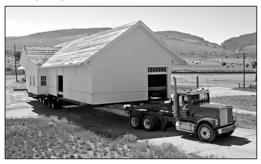
Turning from Depot Street, crossing Gore Avenue heading North on South 5th Street with Gore Canyon in background.

The Town of Kremmling, Colorado, the Union Pacific Railroad and the Grand County Historical Association (GCHA) have been working since March 2008 to save the last existing DNW&P frame depot built with this floor plan from being demolished. It was built by Dave Moffat in June 1906 and was moved this month to the Kremmling Heritage Park Site and set next to the historic McElroy Livery barn.