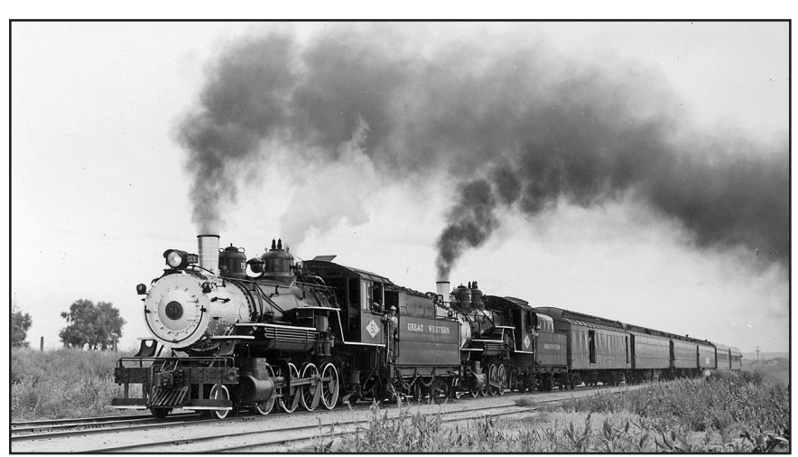
Great Western 51 and 75 at Tuber, Colorado, with a Rocky Mountain Railroad Club special on September 10, 1961.

Members may contact me at: jimrrtrain@gmail.com Phone: 307-637-4011 Rocky Mountain RR Club – President PO Box 2391 Denver, CO 80201-2391