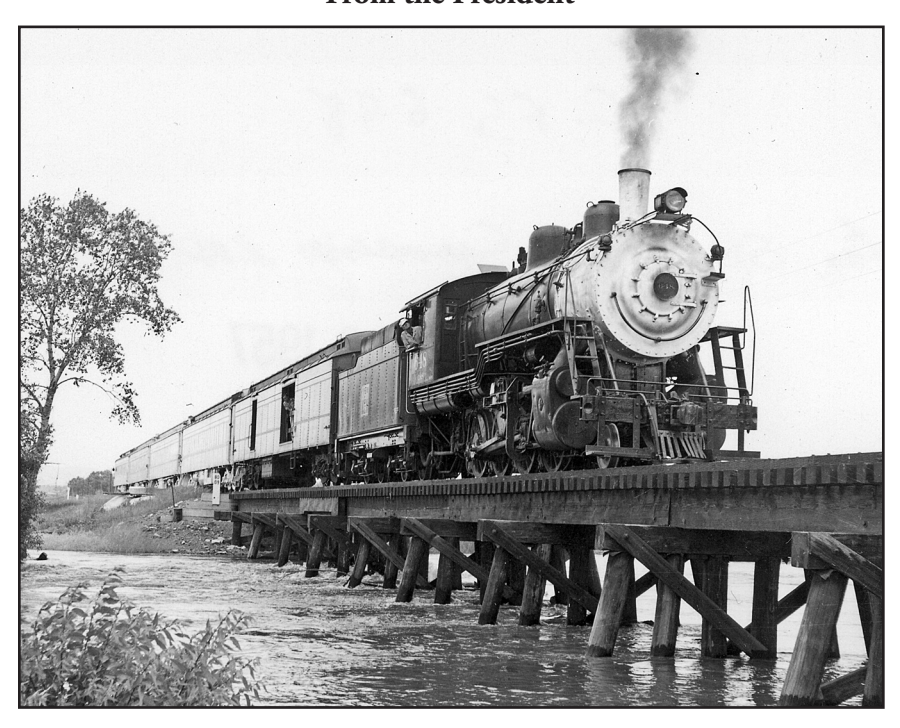
C&S 648 at the Washington Street Road Crossing east of Ft. Collins, Colorado on June 30, 1957.

to Windsor where the GW engine 90 (a 2-10-0) pulled the train to Longmont where the 374 returned the group to Denver.