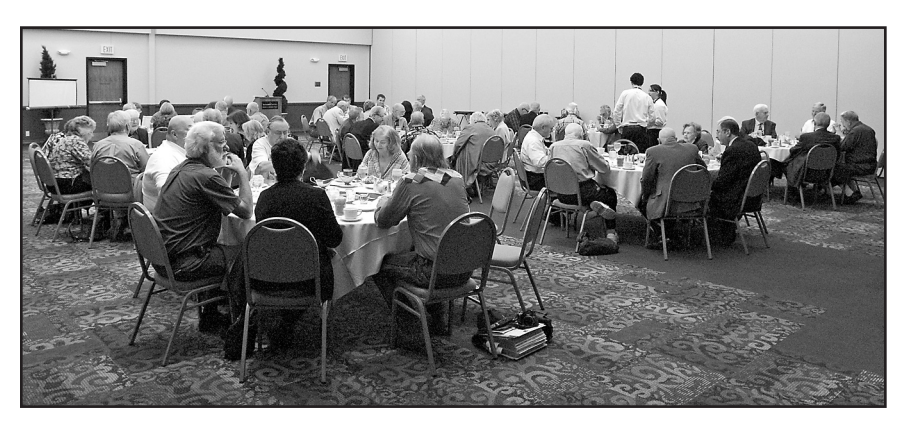
Members enjoy a great lunch at the Arvada Center.