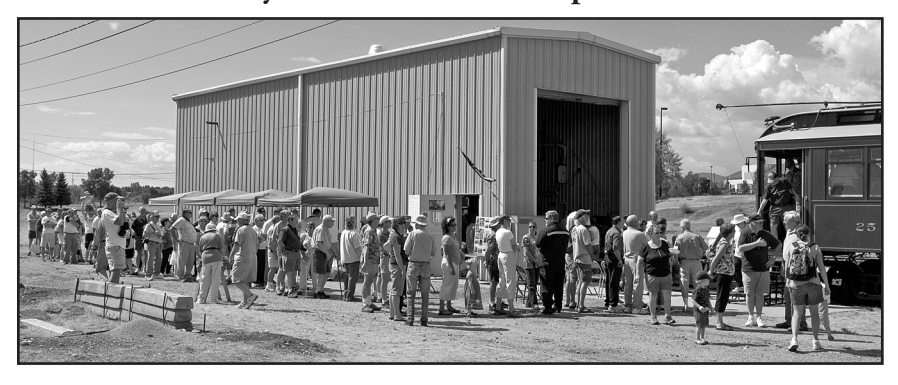
The line of guests waiting to ride D&IM Trolley No. 25 was long most of the day.

attention from generous donors for which we are most grateful.