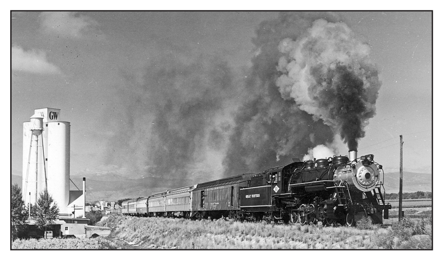
Great Western 90 leaving Longmont, Colorado, with a Rocky Mountain Railroad Club special on September 9, 1962.