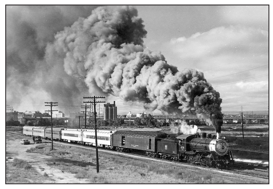
Colorado & Southern 638 leaving Denver with a Rocky Mountain Railroad Club special on September 9, 1962.

family and tourist related activities such as a gunslingers shoot-out at the station and a rodeo which were well attended.