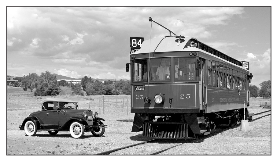
D&IM No. 25 at the open house and roll-out.