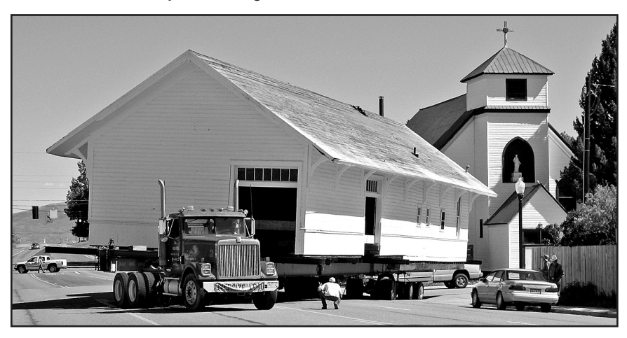
Turning past St. Peter's Catholic Church on to US Hwy 40 (Park Avenue).