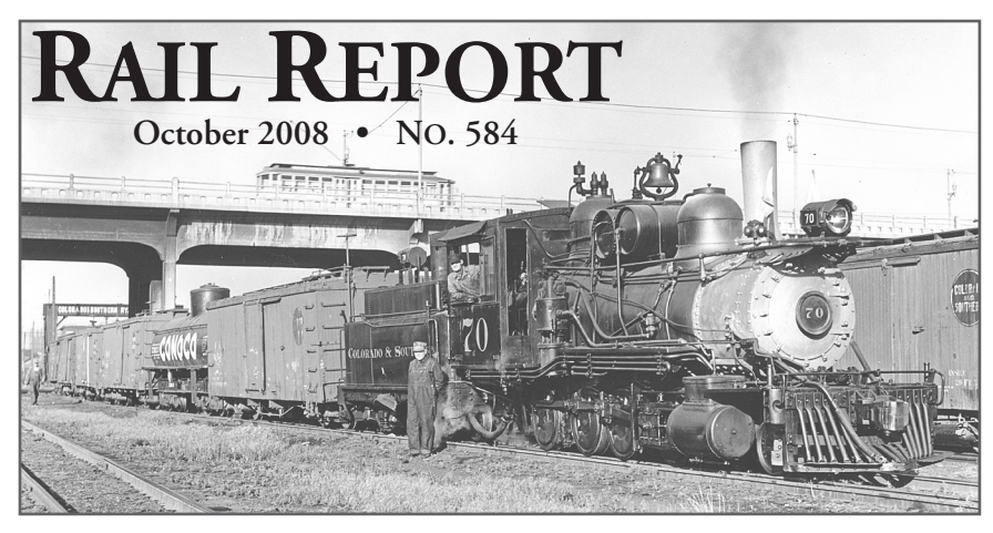
Rocky Mountain Railroad Club • Rocky Mountain Railroad Historical Foundation